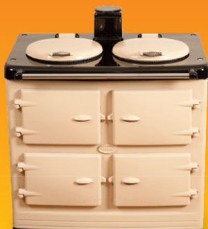
Oil Fired & Solid Fuel Range Cookers