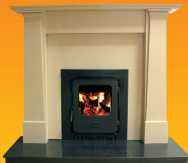
Multifuel Backboiler & Dry Inset Stoves

For information on all Firebird products, please contact your local merchant/builder provider or Firebird.