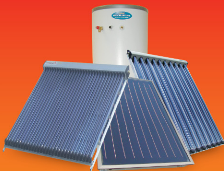
Solar Thermal Systems