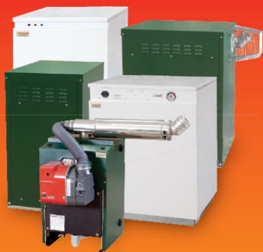
Enviromax Condensing Boilers